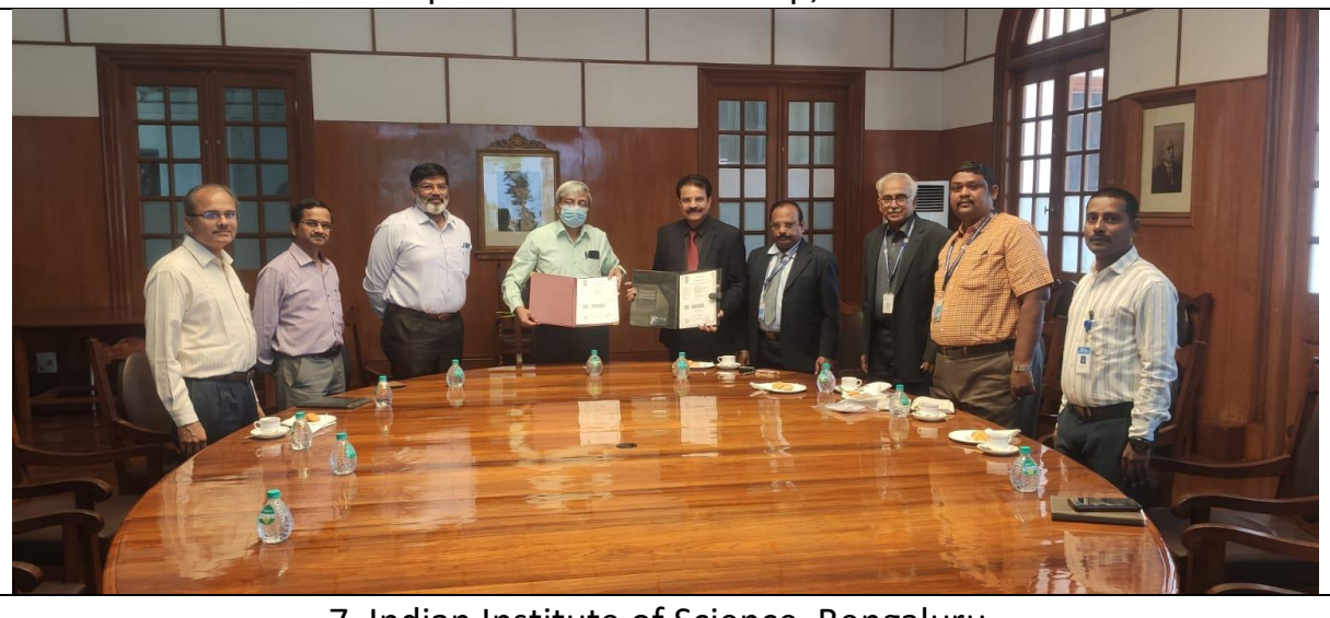
7. Indian Institute of Science, Bengaluru.