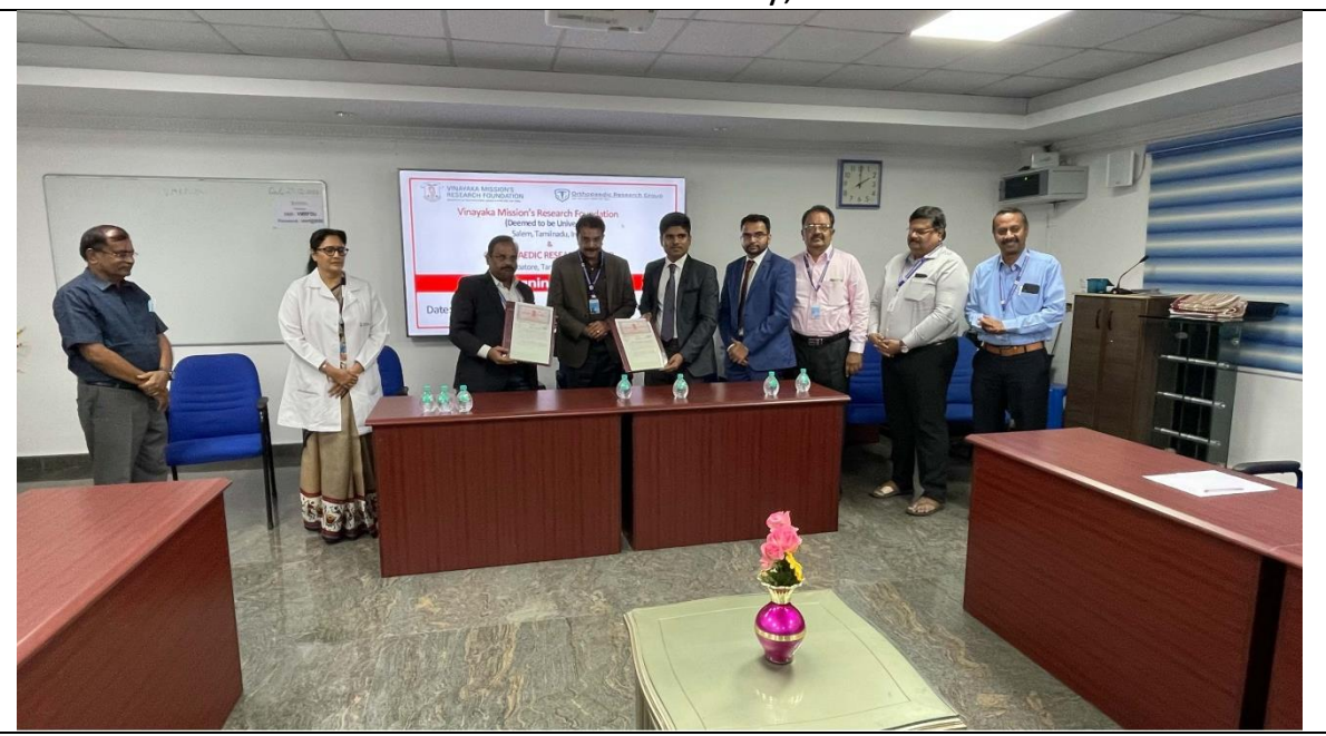
6. Orthopaedic Research Group, Coimbatore.